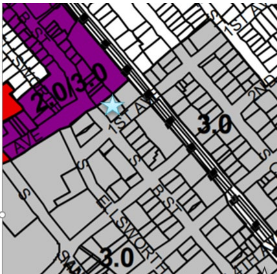
General Plan Map LU-5