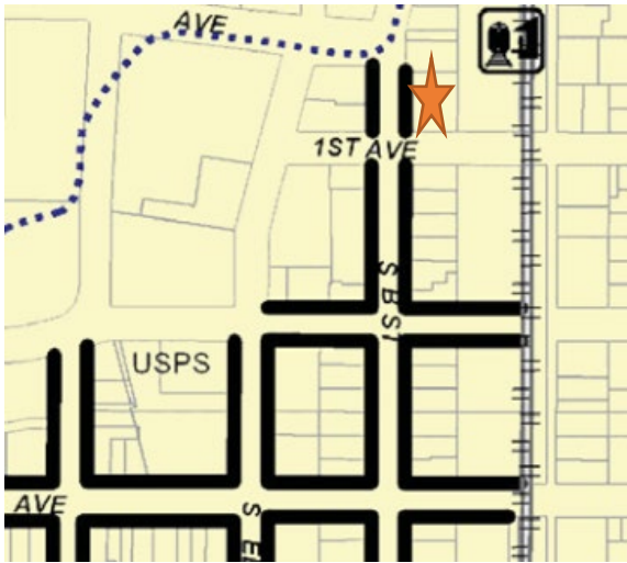
Downtown Area Plan-figure 11 (Retail Frontage Zone)