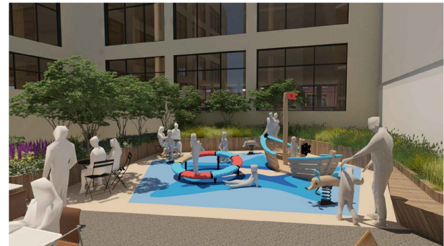
Sculptural play area with seating area