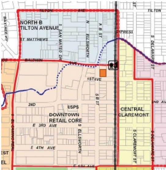
Downtown Area Plan-figure 2